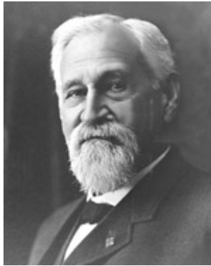
MSU President 1880-1899